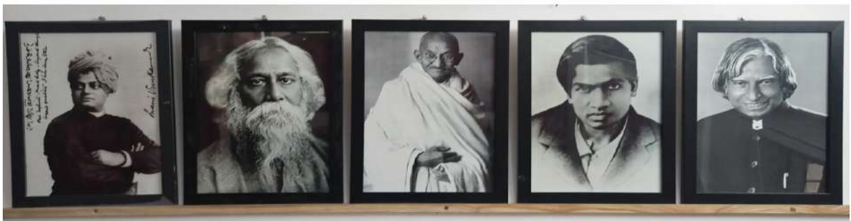
Vivekananda, Rabindranath Tagore, Mahatma Gandhi, Srinivasa Ramanujan, Dr. APJ Abdul Kalam