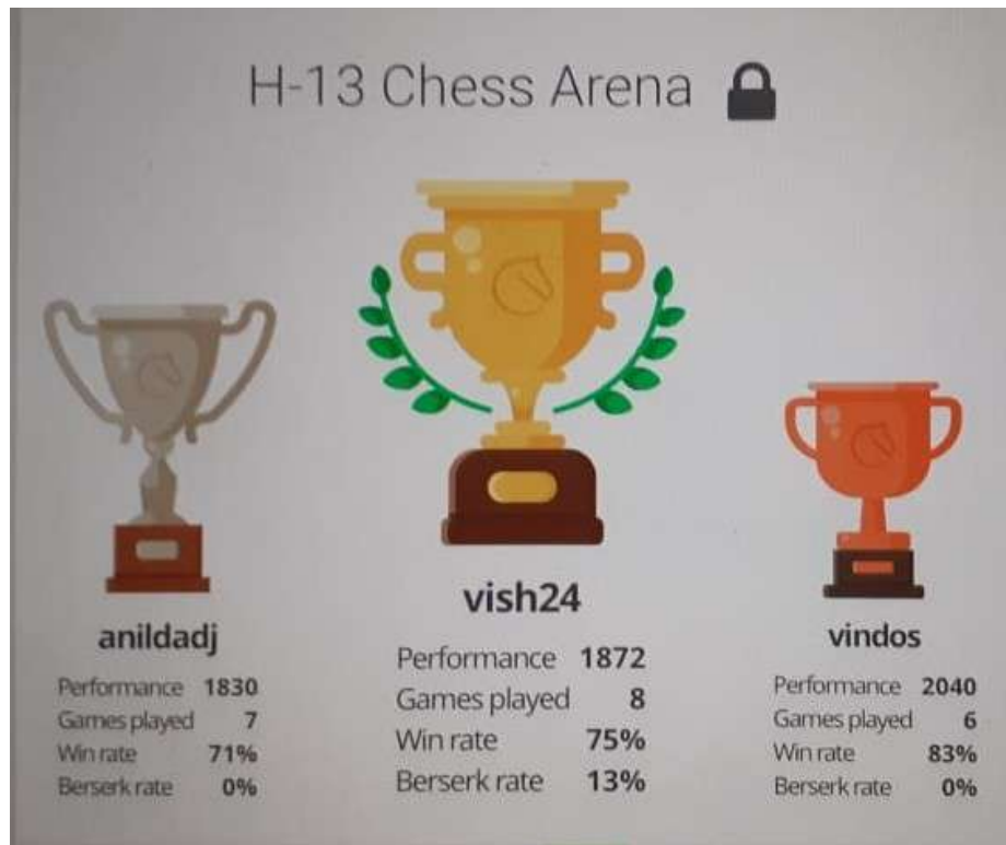
Online Chess Competition Results