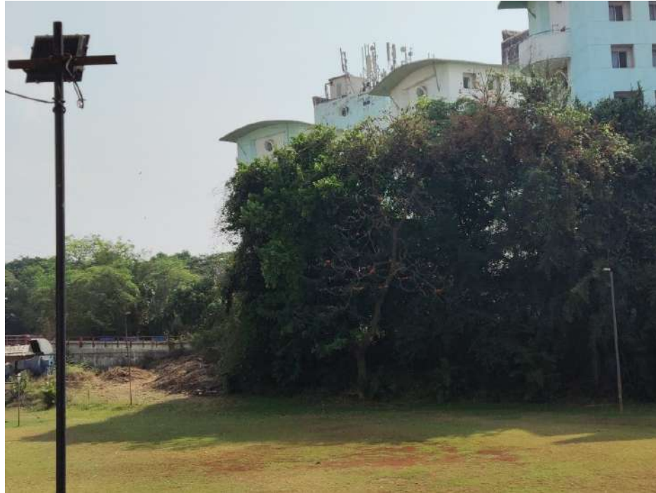
Flood Lights installed in ground