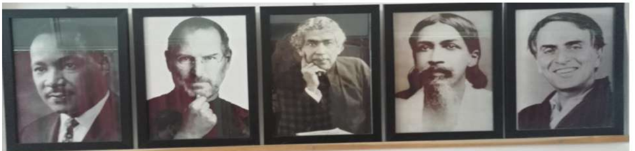
Martin Luther, Steve Jobs, Jagdish Chandra Basu, Aurobindo Ghosh, Carl Sagan