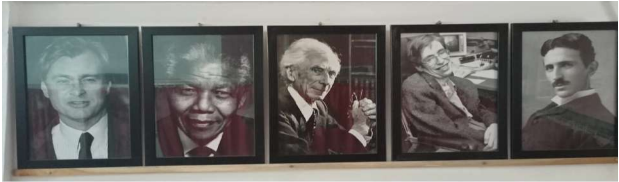
Christopher Nolan, Nelson Mandela, Bertrand Russell, Stephen Hawking, Nikola Tesla