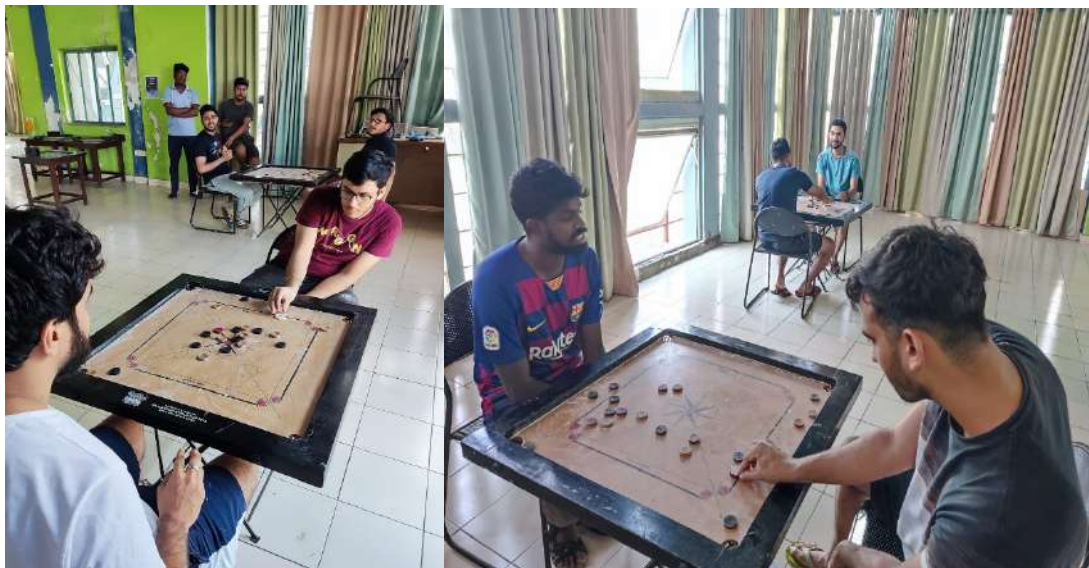
Offline Carrom Competition