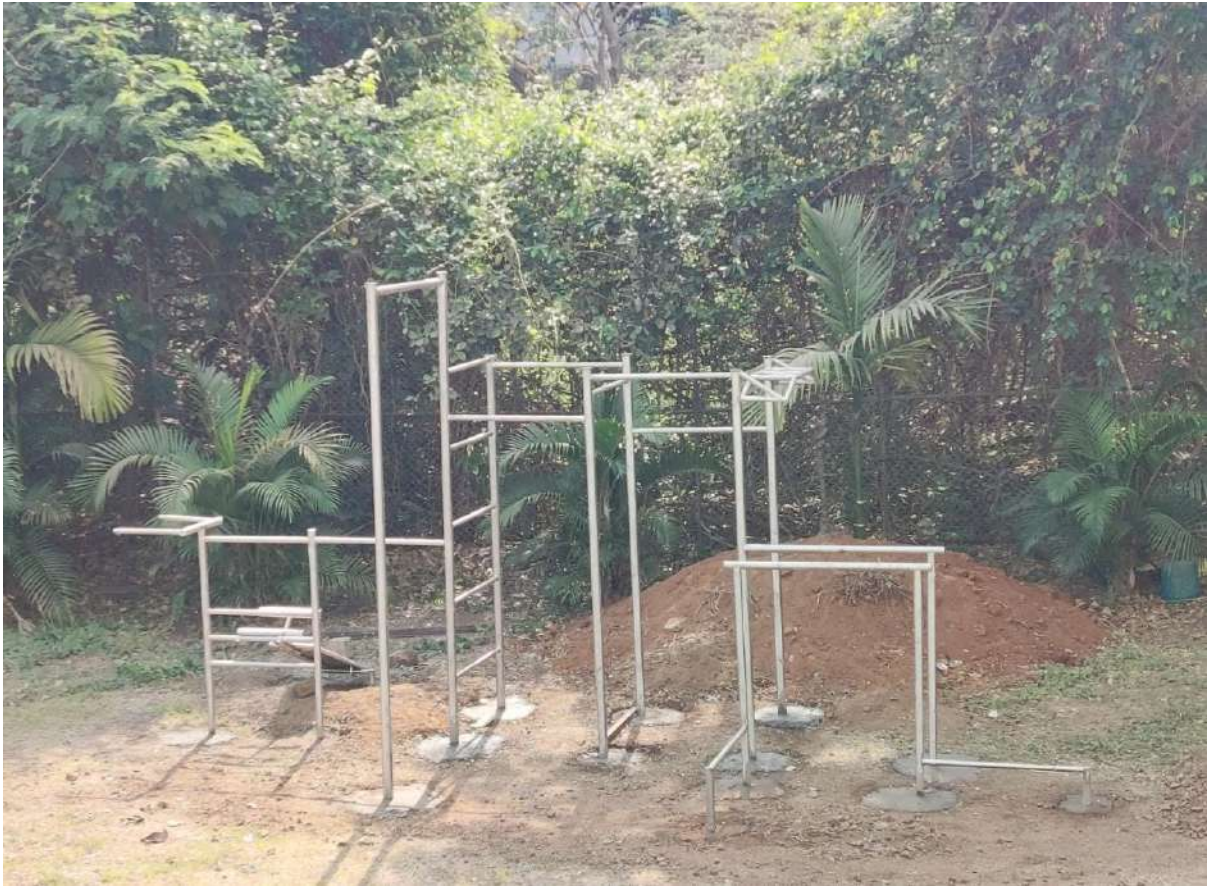
Open Gym/ Calisthenics Setup