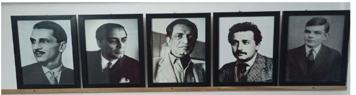
JRD Tata, Homi J Bhabha, Satyajit Ray, Albert Einstein, Alan Turing